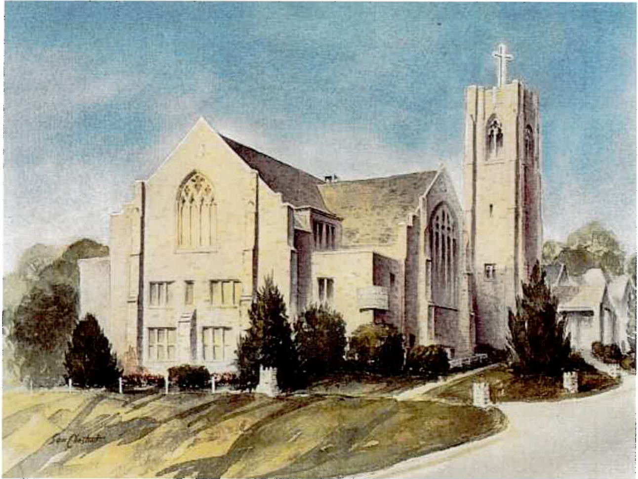
Carmel Presbyterian Church 100 Edge Hill Road Glenside, PA 19038 (215) 887-1074 www.presbycarmel.org

We praise you, we worship you, we adore you. You hold the heavens in your hand, all stars rejoice in your glory. You come in the sunrise and the song of morn and bless the splendor of the noonday. The stars in their courses magnify you, day and night tell of your glory. Your peace blows over the earth and the breath of your mouth fills all space. Amen.