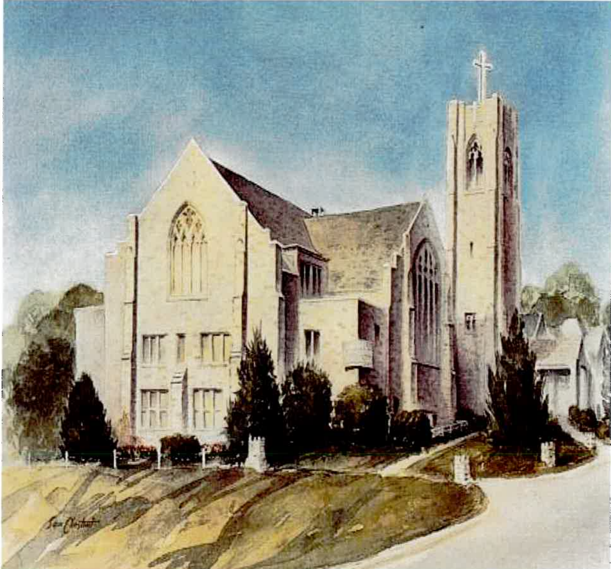
Carmel Presbyterian Church 100 Edge Hill Road Glenside, PA 19038 (215) 887-1074 www.presbycarmel.org

We praise you, we worship you, we adore you. You hold the heavens in your hand, all stars rejoice in your glory. You come in the sunrise and the song of morn and bless the splendor of the noonday. The stars in their courses magnify you, day and night tell of your glory. Your peace blows over the earth and the breath of your mouth fills all space. Amen.