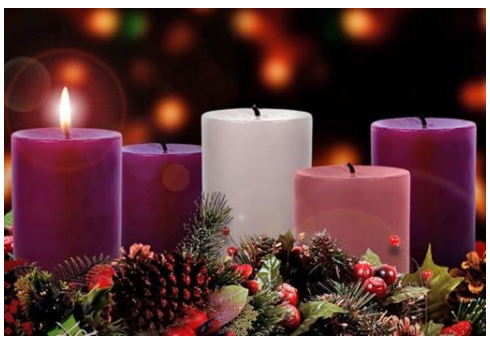
A Week of Hope