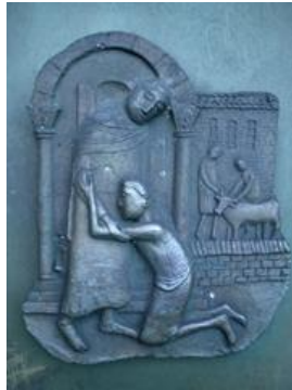
Prodigal Son, in the Galway Cathedral, from Art in the Christian Tradition , a project of the Vanderbilt Divinity Library, Nashville, TN.